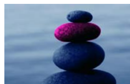
Corporate & Commercial