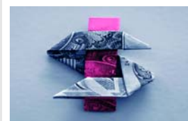
Banking & Finance