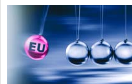
EU & Competition