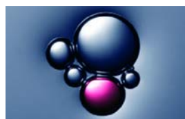
Merger & Acquisition